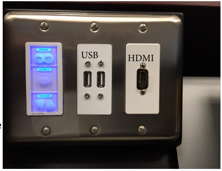
Figure 1. Projector and Sound Control Panel

Note: The Source button is used for peripherals, such as a document camera, and is not used in this room.