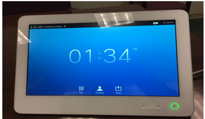
Figure 1. Touch Panel

Note: The Panel has volume control, and microphone on/off control in the lower right hand corner. Camera control in upper right hand corner.