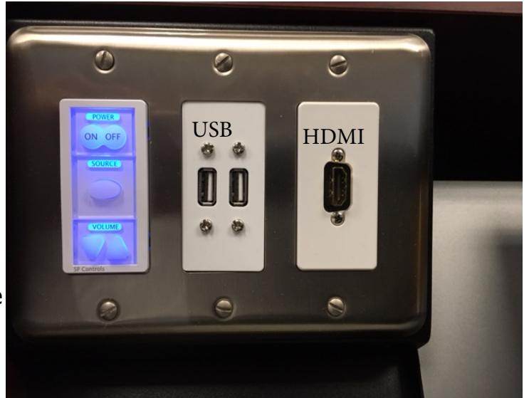
Figure 1. Projector and Sound Control Panel

Note: The Source button is used for peripherals, such as a document camera, and is not used in this room.